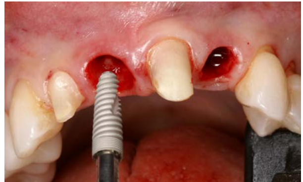
4 - Implant Insertion Ritter Spiral