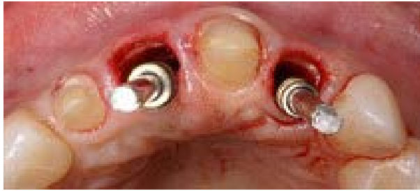
1 - Socket Shield