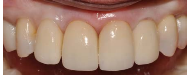
11 - Final at 3 Years