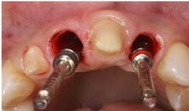
3 - After Osteotomies