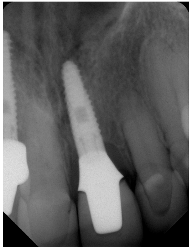
9 - X-Ray