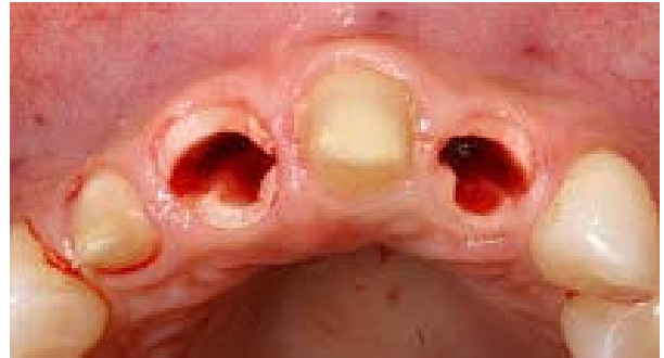
2 - SS Preps