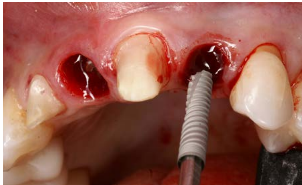
5 - Implant Insertion Ritter Spiral