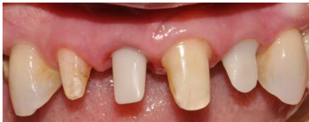
10 - Ceramic Abutments