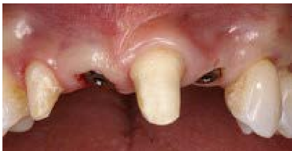
7 - After Healing 3 Months