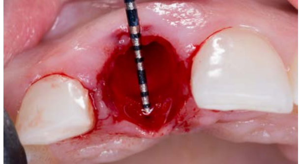
4 - Alveolus