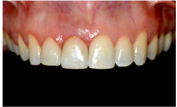
10 - Final Crown