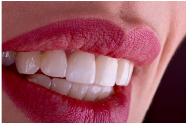
11 - Smile