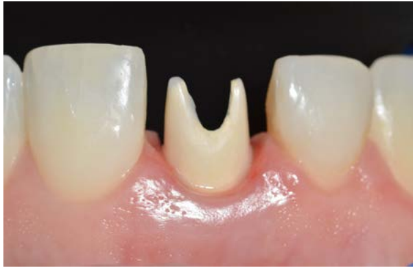
9 - Abutment Prep