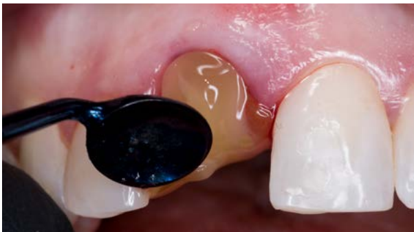
7 - PRF