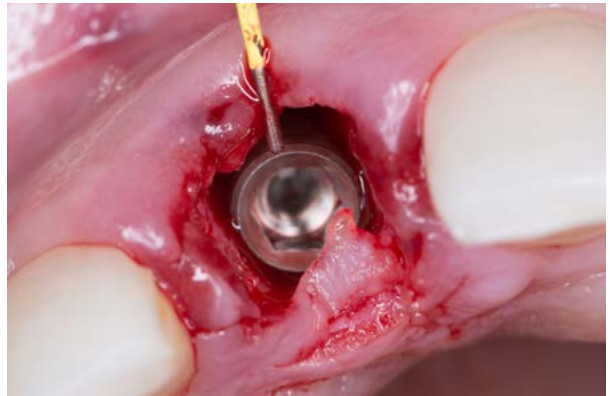
6 - Implant Width