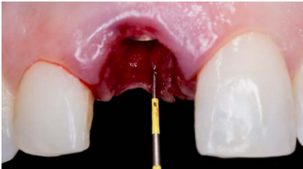
5 - Implant Depth