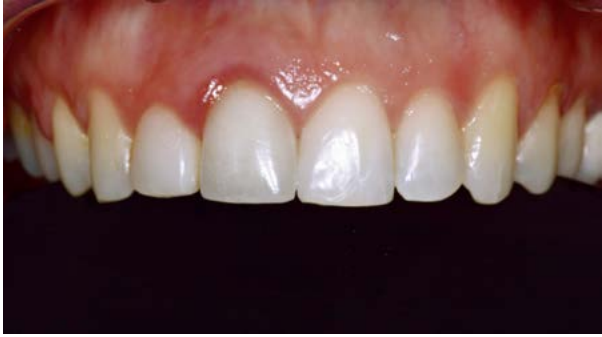
1 - Initial