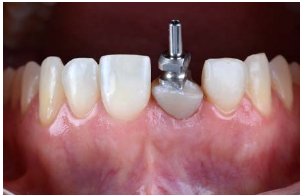
8 - Impression Coping