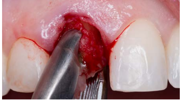
2 - Extraction